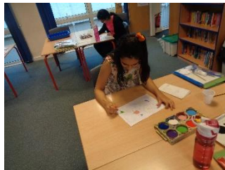
Brilliant concentration and care.